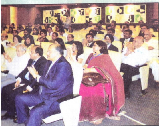
the audience at the event

members from outside Mumbai were also present,