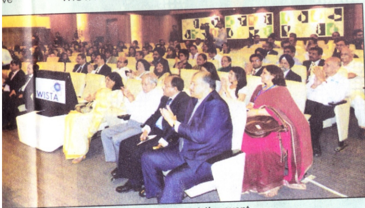
A section of the audience at the event

WISTA members from outside Mumbai were also present,