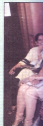
Sharing a laugh